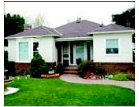
The average price of a home sold in Belmont during 2007 (through September) is $950,070, up from a 2006 average of $900,322.